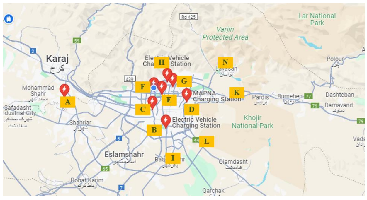
Figure 6: Final location for electric vehicle charging station.

This table (3) and Figure (6) contain information about various locations' coordinates, demand, budget, and activation status, with all locations currently labeled as "Potential." The activation column suggests whether these locations have been activated for a specific purpose or operation.