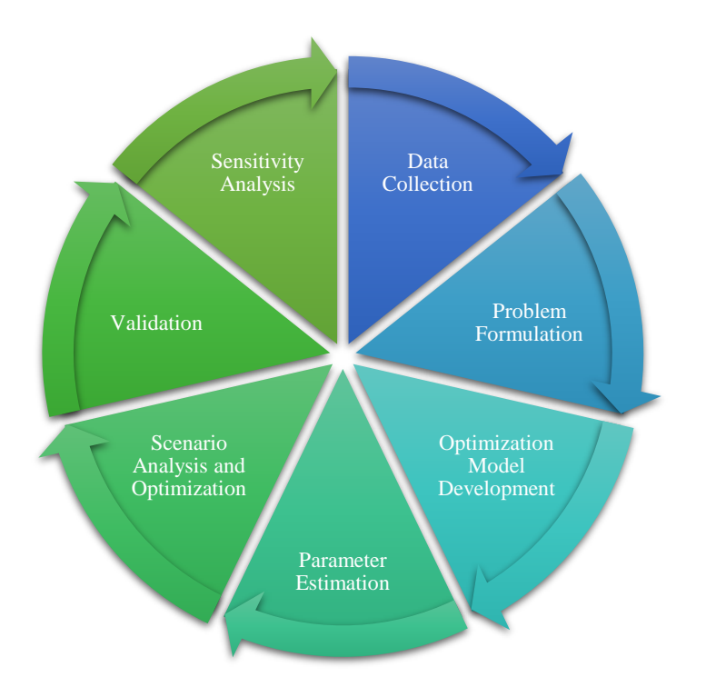
Figure 2: Research methodology.