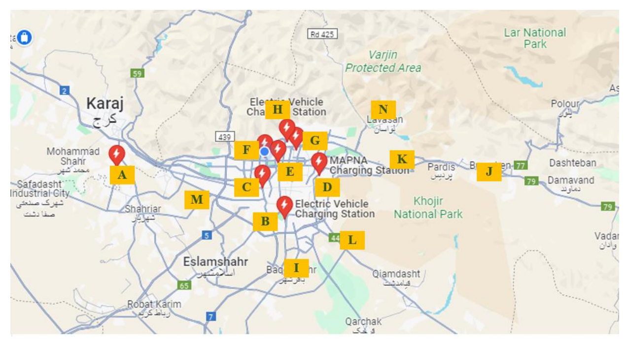
Figure 4: Potential location for electric vehicle charging station.