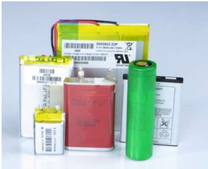
Figure 1: Lithium-ion battery types.

Choosing the optimal battery type for a specific application becomes a complex multi-criteria decision-making problem. Balancing technical criteria like specific energy, specific power, cycle life, calendar life, safety, and environmental impact alongside economic considerations like cost and availability requires a systematic and holistic approach (see Figure 1) [7-10].