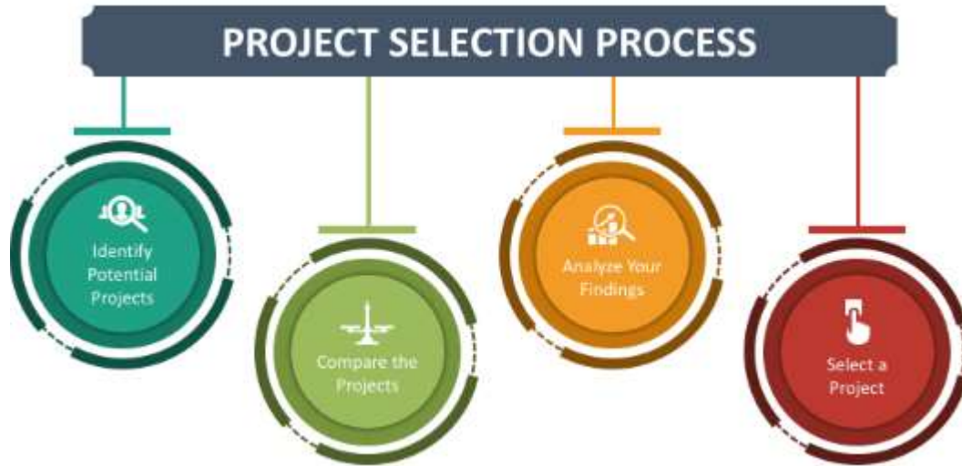
Figure 1: Project Selection in Construction Industry.

This paper presents a hybrid MCDM-ML approach to project selection in the construction industry. The hybrid approach combines the strengths of MCDM methods and ML approaches to provide a more comprehensive and informed approach to project selection [13].